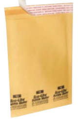
Priced per Mailer