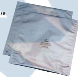
Priced per Package