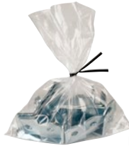
Priced per Package

Ties made of 27 gauge single wire are available in various colours and lengths. Packed 2000 per box.