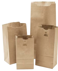
Priced per Bundle